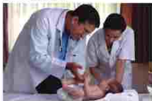
Most babies require basic healthcare

The problem does not end with Infant Mortality Rate. The last column of table 1.4 shows that about half of the children aged 14-15 in Bihar are not attending school beyond Class 8. This means that if you went to school in Bihar nearly half of your elementary class friends would be missing. Those who could have been in school are not there! If this had happened to you, you would not be able to read what you are reading now.